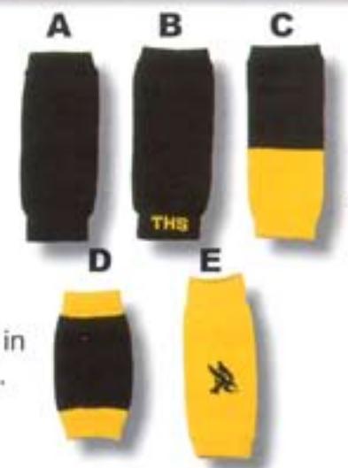
TERRY WRISTBAND Available in any color.