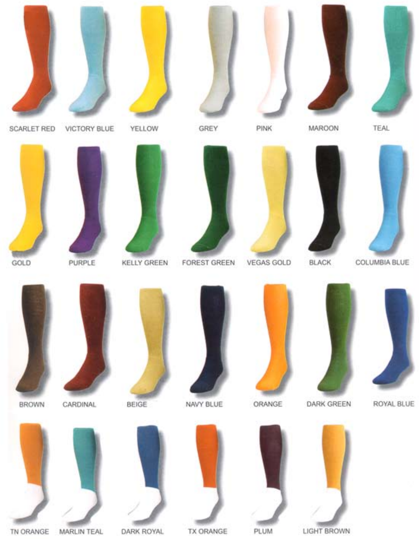
SCARLET RED VICTORY BLUE YELLOW GREY PINK MAROON TEAL GOLD PURPLE KELLY GREEN FOREST GREEN VEGAS GOLD BLACK COLUMBIA BLUE BROWN CARDINAL BEIGE NAVY BLUE ORANGE DARK GREEN ROYAL BLUE TN ORANGE MARLIN TEAL DARK ROYAL TX ORANGE PLUM LIGHT BROWN