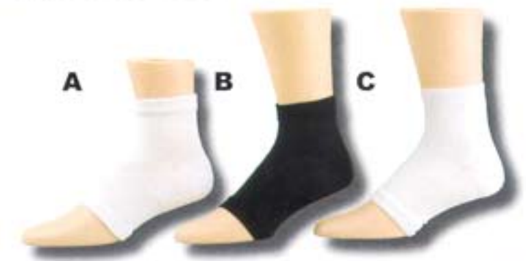
Option A: welt top and bottom with ankle & arch support. Option B: welt top and bottom with full flat knit. Option C: single welt top with ankle & arch support and double welt bottom.