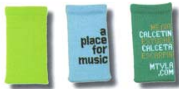
CUSTOM IPOD POCKETS Custom fitted with optional front & back knit in logos or text, available in multi colors as well.