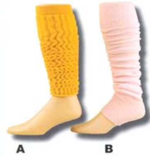
80% ACRYLIC / 20% NYLON